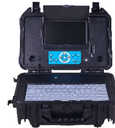
1 × Control Box